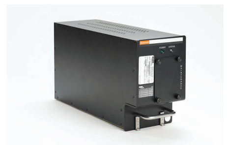
Modem Manager (Modman)

Both antenna options include a common RF and antenna controller, modem and router.