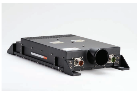
Ka-Band Radio Frequency Unit (KRFU)