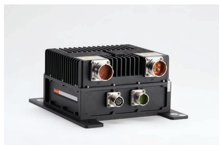
Ka-Band Aircraft Networking Data Unit (KANDU)